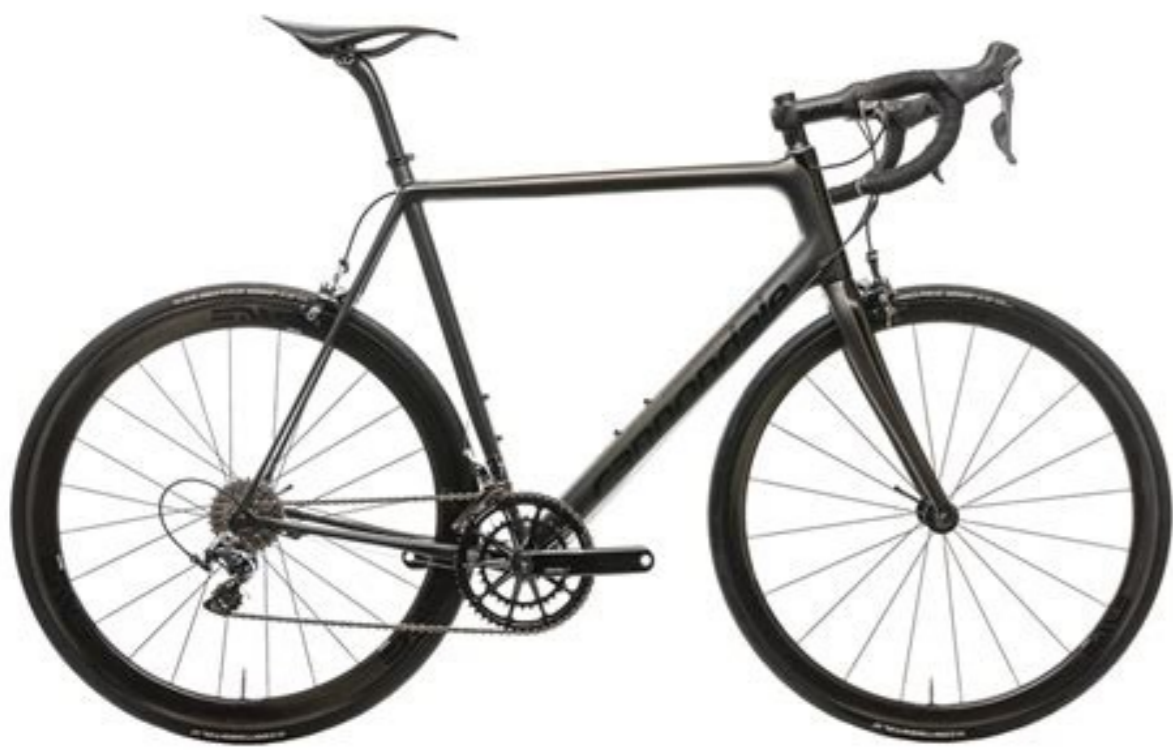
Cannondale supersix evo 2015 specs.